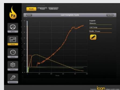
FreezePoint last cycle screen

Best-in-class cooling performance: reduced thermal losses, coupled with the low-mass measuring cell and vacuum insulation, enable the maintenance-free cryo-cooler to cool down to -100°C within 10 minutes using normal plant-cooling water.