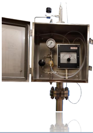
Typical Py-Gas Configuration